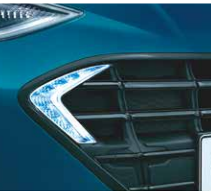
Boomerang Shaped LED DRLs