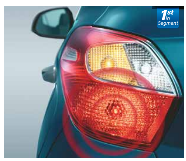
Emergency Stop Signal