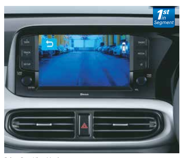
Driver Rear View Monitor