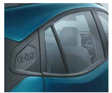
Unique Gi10 Branding on C Pillar