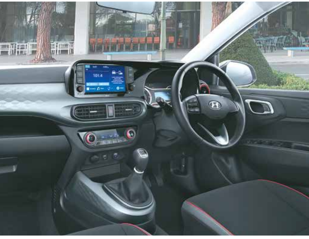
Dual Tone Interior Option

The All New GRAND i10 NIOS gets its smart technology from the Hyundai stable; like the Best-in-segment 20.25 cm Touchscreen Infotainment System with Smartphone Connectivity. Advanced technology is always working behind the scene to make every drive a convenient yet richly immersive experience.