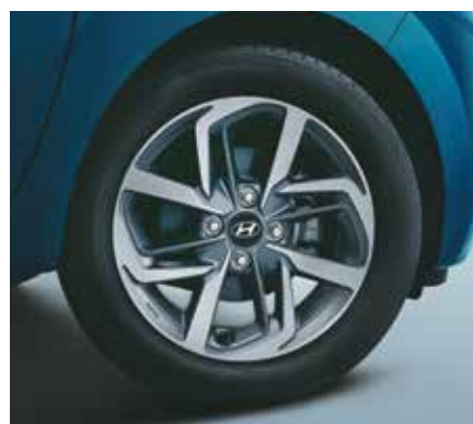
R15 Diamond-cut Alloy Wheels