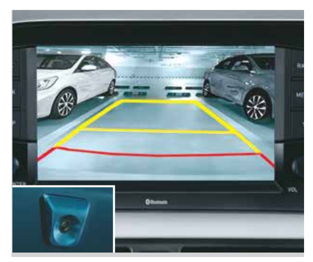
Rear Parking Camera with Display on 20.25 cm Screen

Impact Sensing Auto Door Unlock / Speed Sensing Auto Door Lock | Headlamp Escort Function