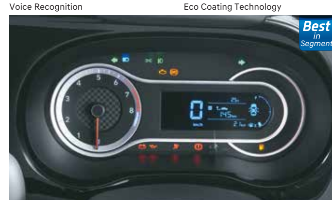
13.46 cm Digital Speedometer