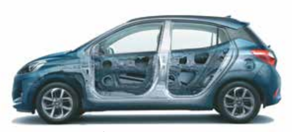
Strong Body Structure-65% (AHSS + HSS)