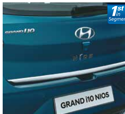
Rear Chrome Garnish

Roof Rails | Air Curtain | Sporty Rear Skid Plate | Turn Indicators on Outside Mirrors